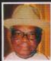
Olorogun Sen. Felix Ibru President General UPU Worldwide